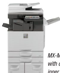
MX-M6050 shown with compact inner finisher.

When it’s time to get the job done, the Essentials Series monochrome document systems are outstanding performers. Quickly scan documents at speeds up to 80 images per minute . Then use the manual stapling feature on select finishers to restaple your originals. Multiple finishing options give you the output you require, be it stacked, stapled or saddle-stitched. There’s even an available built-in stapleless staple feature, which can bind up to five sheets of paper by adding a crimp to the corner of the set, saving regular staples for larger sets.