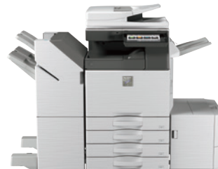
MX-M6050 shown with 3K saddle stitch finisher and large capacity cassette.