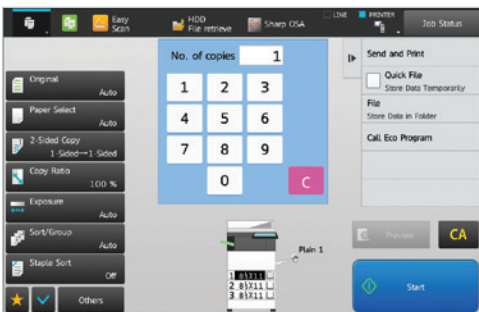
Standard Copy Screen offers more advanced features.