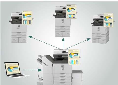
With Serverless Print Release you can securely print a job and release it from up to six Essentials Series models (including host).

The monochrome Essentials Series offer standard PCL 6 and optional Adobe PostScript 3 printing systems to help you speed through all of your output needs with accuracy. To help streamline your jobs, these powerful performers include Serverless Print Release , enabling you to securely print a job and release it from up to six Essentials Series models (including host) on your network. And with Google Cloud Print web printing service, you can print from Chromebook™ notebook computers, PCs and more from virtually anywhere.