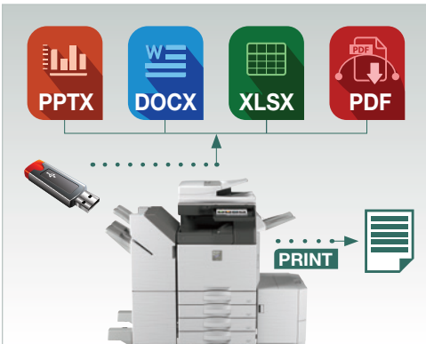
Direct print to popular file formats seamlessly with Sharp's available Direct Print Expansion Kit. 1