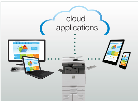
Distribute, access and print documents more easily.

Sharp makes it easy to send documents to the destinations you need, and goes beyond traditional network scanning with optional Email Connect and Cloud Connect features. With Email Connect, scan to email is seamlessly integrated with Microsoft Exchange and Gmail™. With Cloud Connect, you can easily scan to and print from Microsoft OneDrive for Business, SharePoint Online and Google Drive without additional middleware. Sharp also makes it easy to collaborate and share documents with available Cloud Portal Office document storage and sharing service. Capture, index and archive your documents easily and securely.