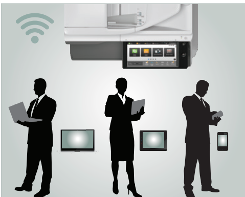
Available wireless network interface for convenient scanning and printing from mobile devices.

From paper handling to networking, the MX-M5050 and MX-M6050 monochrome Essentials Series will exceed your expectations.