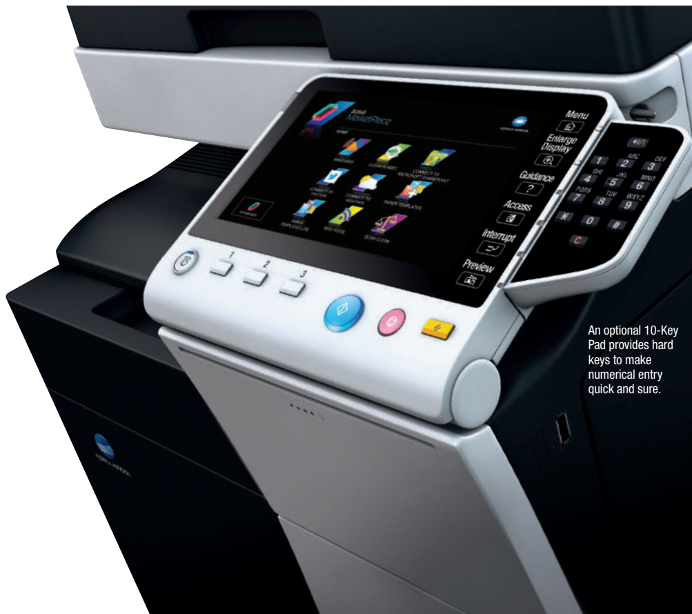
An optional 10-Key Pad provides hard keys to make numerical entry quick and sure.

In today's fast-moving digital world, needs keep changing – and Konica Minolta's EnvisionIT approach extends your power to take advantage of emerging business and professional opportunities. You'll have all the options you need: downloadable productivity apps, high-speed fax, i-Option kits and PageScope software to manage documents and devices. You'll also benefit from bEST integration with 3rd-party business software for specialized solutions – including variable-data printing, account tracking, cost recovery and more.